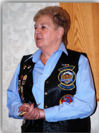
NH G Newsletter